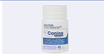
VAL1204 Canine All Wormer 10kg 40s