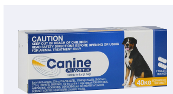
VAL1216 Canine All Wormer 40kg 2s