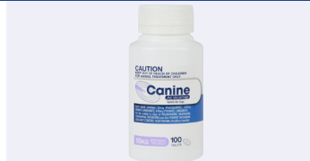
VAL1205 Canine All Wormer 10kg 100s