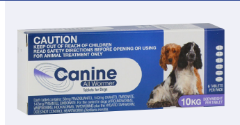
VAL1202 Canine All Wormer 10kg 6s