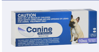
VAL1200 Canine All Wormer 10kg 2s