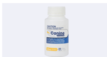
VAL1219 Canine All Wormer 40kg 25s