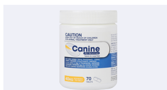
VAL1220 Canine All Wormer 40kg 70s